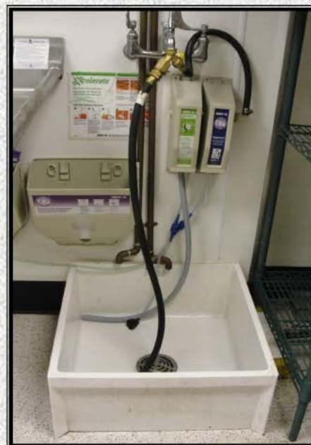
CURBED CLEANING FACILITY