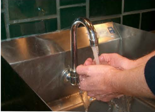
1. Wet hands with running water,