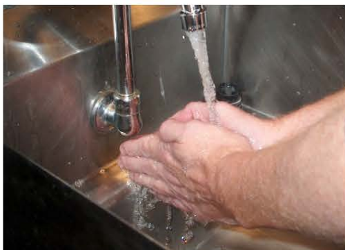
4. Rinse under clean running water