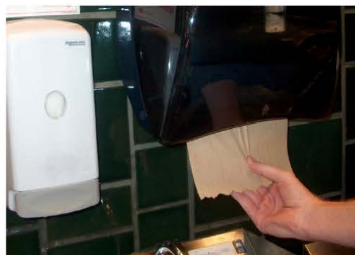
5. Dry cleaned hands and arms