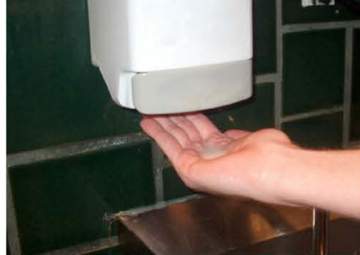
2. Apply soap