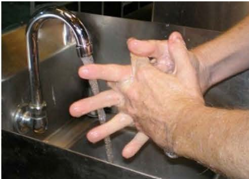
3. Vigorously scrub lathered fingers, fingertips,