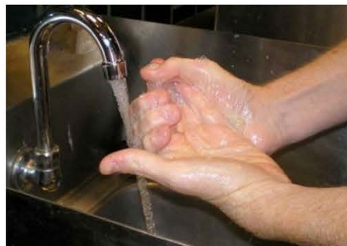
scrub hands and arms for at least 10 to 15 seconds